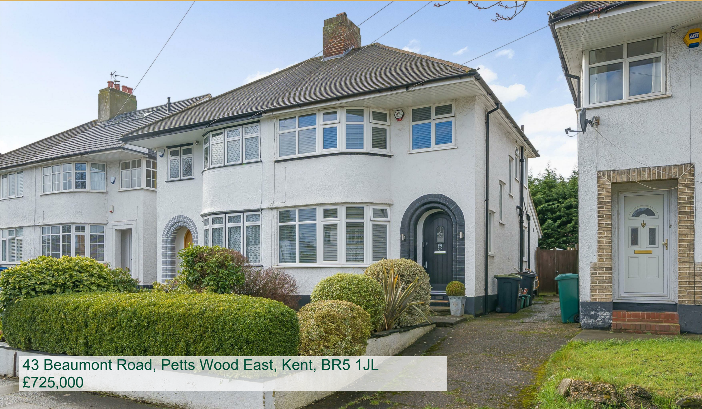
43 Beaumont Road, Petts Wood East, Kent, BR5 1JL £725,000